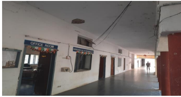
Spoilt electrification – freely hanging cables