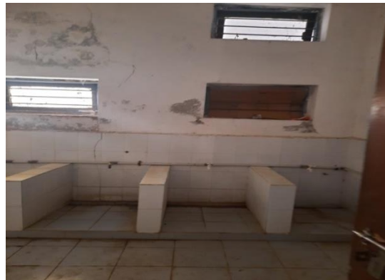
Toilets for girl students