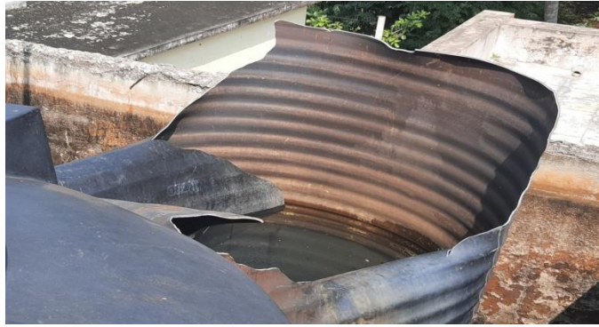
Overhead tank in poor condition