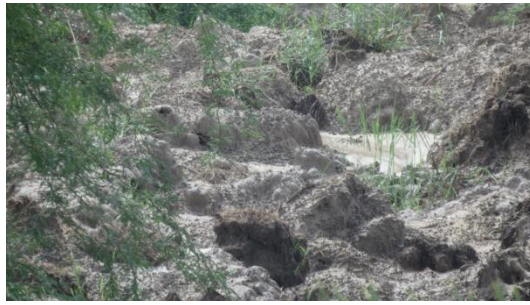
Open land in the campus area