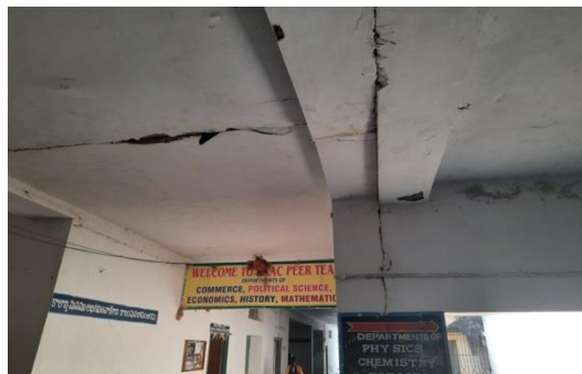
Spoilt beams and roof