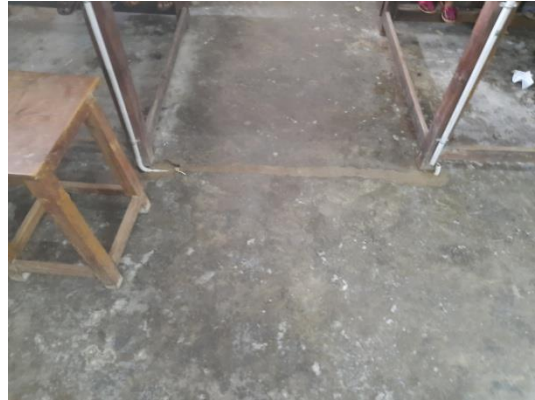
Spoilt Flooring in physics lab