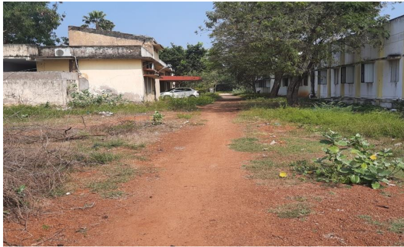
Internal pathways unprotected