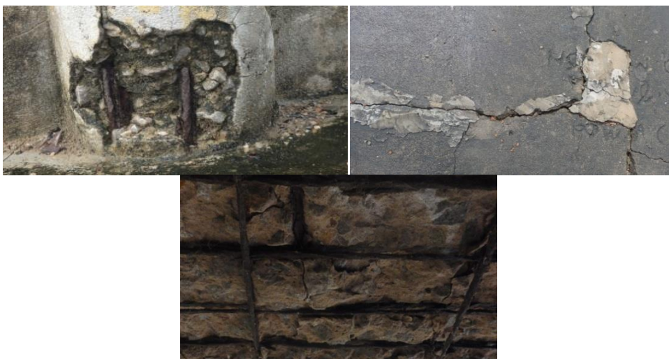
Leaky roof, spoiled pillars