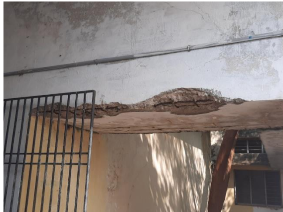
Sun shades spoilt