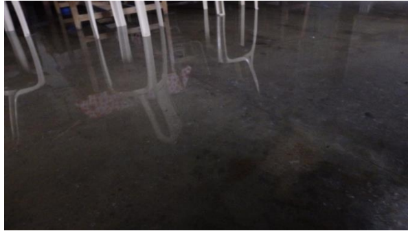
Water logging in the labs