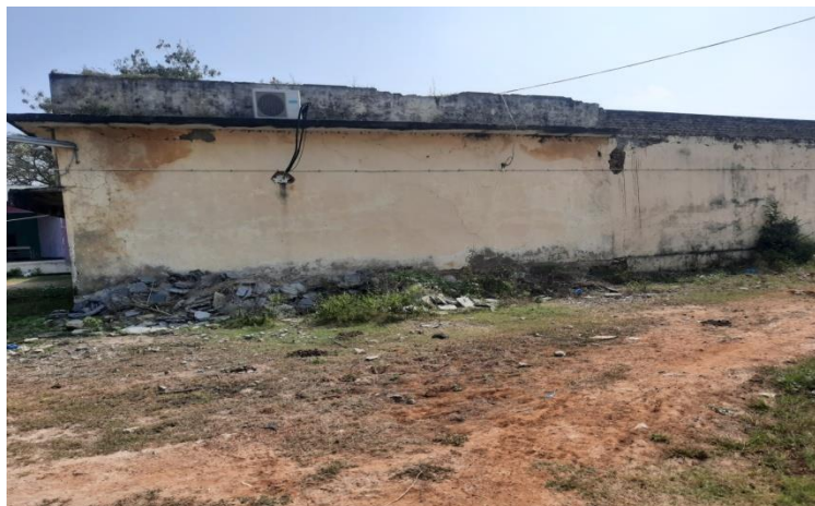
Spoilt sunshades, parapet walls rendering the structure susceptible