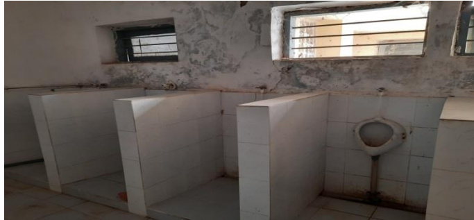
Toilets in poor condition