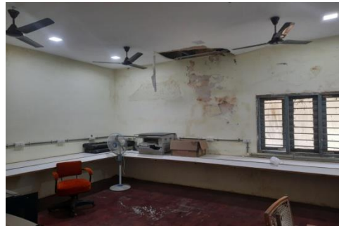
Dilapidating false roof in computer lab